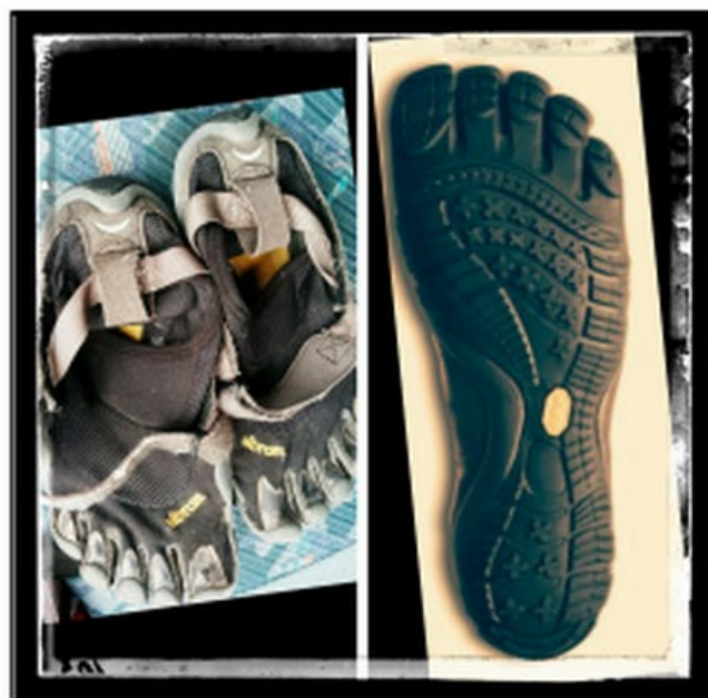
VFF Keep Stuff Out - KSO

And no, I do not run in them in all of my runs. I run my VFF Komodo Sports on pavement – and all terrain. My VFF Keep Stuff Out in Pavement/Grass/Cross country terrain – but currently using them as my wall climbing shoes. And my regular TNT shoes is my VFF Sprints and my VFF Seeyas.