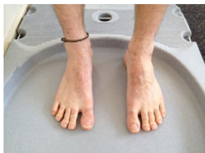
Spread and Hold