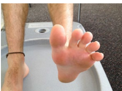
With Toe Extension