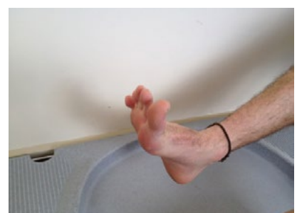
With Toe Extension