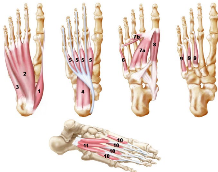
Figure 6 The intrinsic foot muscles are presented in their anatomic orientation within the four plantar layers and the dorsal intrinsic muscle. The numbers correspond to the muscles as follows: (1) abductor hallucis, (2) flexor digitorum brevis, (3) abductor digiti minimi, (4) quadratus plantae (note its insertion into the flexor digitorum tendon), (5) lumbricals (note their origin from the flexor digitorum longus tendon), (6) flexor digiti minimi, (7) adductor hallucis oblique (a) and transverse (b) heads, (8) flexor hallucis brevis, (9) plantar interossei, (10) dorsal interossei and (11) extensor digitorum brevis.

Cheers, Matt Bulman Chiropractor Sports And Spinal Chiropractic www.therunnersclinic.com.au