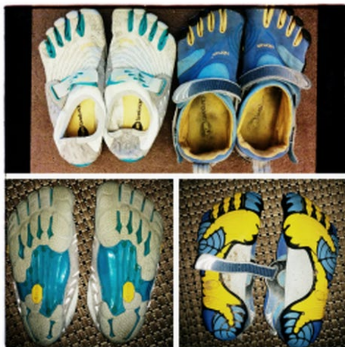
Left: VFF SeeYa; Right: VFF Komodo Sport

The VFF SeeYa and the VFF Komodos are my favorite. The SeeYa is just like running in nothing and the Komodos because it allows me to run in pavement. I use them in anywhere and any activities just like how we use our runners.