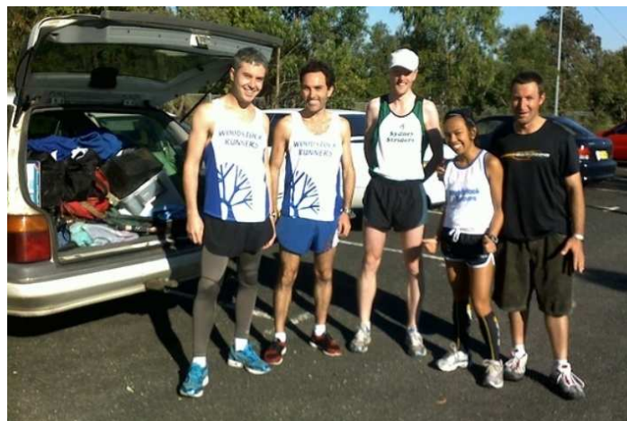
Woodies, the garbage truck and a few intruders! at the ANSW 10K Road 10K